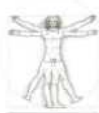
Divine Proportion φ/ Vitruvian Man

33 = Coronation of the One/Sovereign/Self-evident/True Man/φ = 1, 1, 2, 3, 5, 8, 13